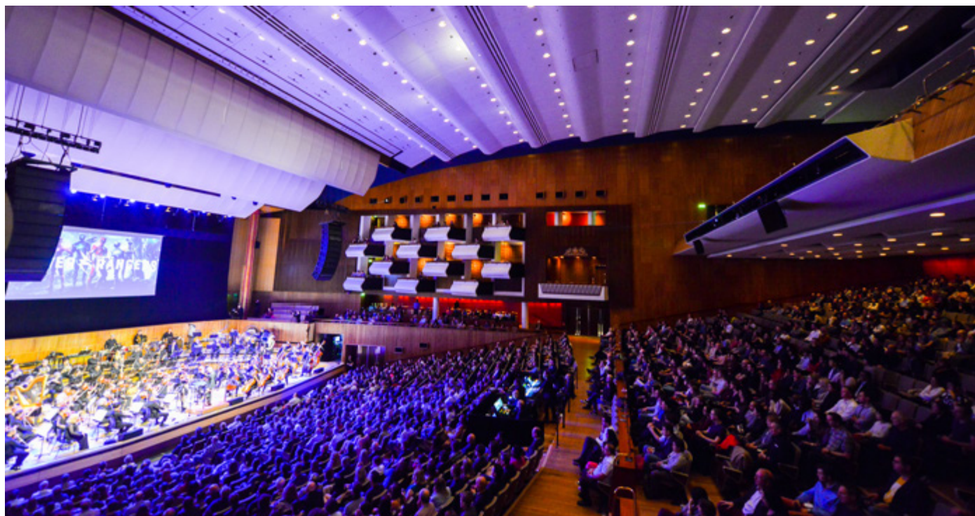
The Philharmonia in concert at the Royal Festival Hall in 2018

The Philharmonia is a registered charity. It relies on income from a wide range of sources to deliver its programme and is proud to be generously supported by Arts Council England.